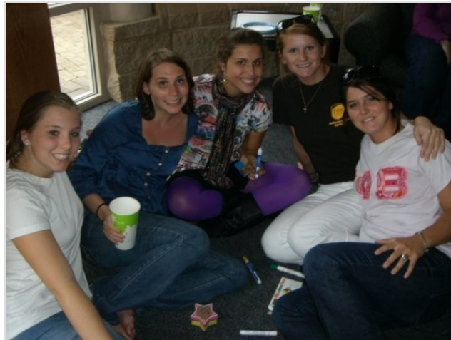
PNM enjoyed crafts and goodies at the Gamma Phi-esta recruitment event!

To include an important date or announcement for your Gamma Phi Beta Sisters, send an email and let us know.